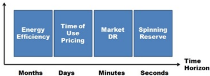
Figure 2: Different time horizon in DSM, based upon [1]

Spinning Reserve in this context refers to primary and secondary and even tertiary control, which is usually done by power plants. However, in DSM, loads can be virtually aggregated and act as negative spinning reserve for frequency control. The time horizon is in between seconds and minutes.